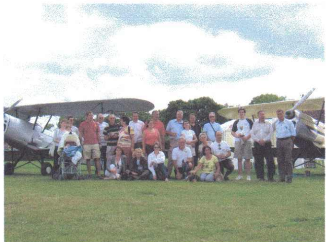
Photo: All ages, shapes and sizes at Headcorn